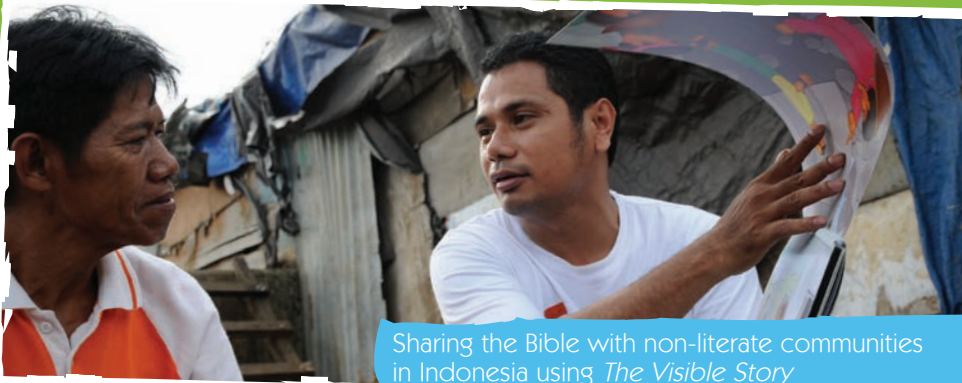
Sharing the Bible with non-literate communities in Indonesia using The Visible Story