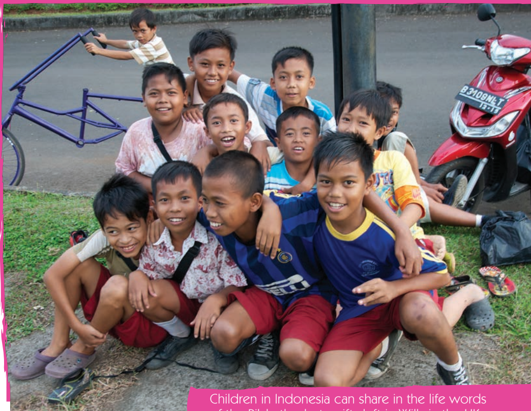
Children in Indonesia can share in the life words of the Bible thanks to gifts left in Wills in the UK