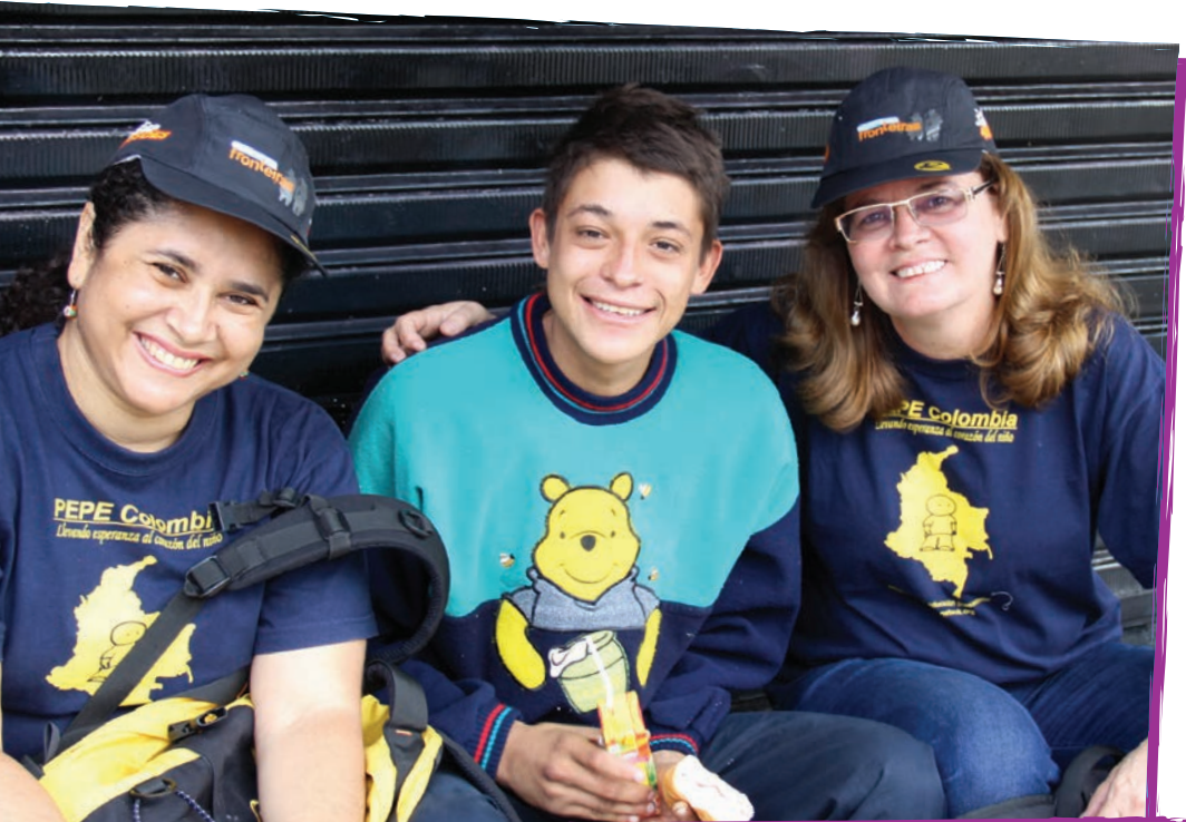
Pavement Project counsellors minister to a child sleeping on the street in Colombia

SGM Lifewords can supply some suggested examples for you to discuss with your solicitor. Remember your codicil must be compatible with your Will so your solicitor will need to see both.